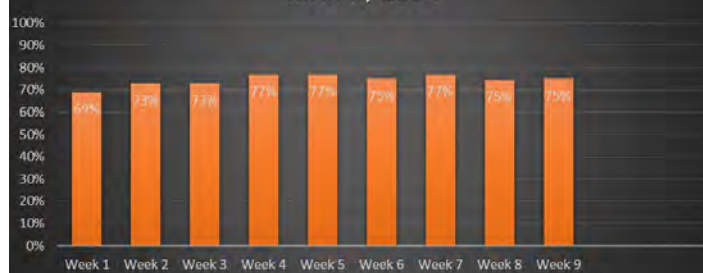
Attendance : Whole School Average Term 3, 2024

SCHOOL AIM - Equal to or Greater Than 90%